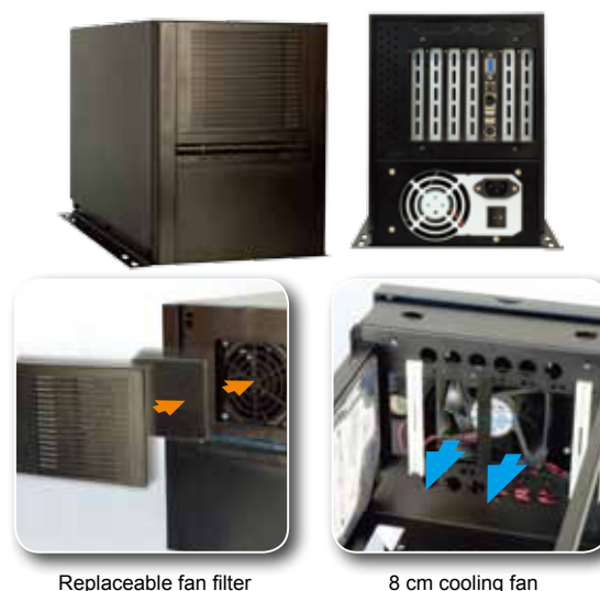
Replaceable fan filter

CD-ROM and HDD are not included in package.